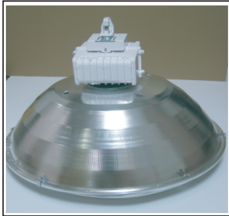
DIAMETER = 32" (812mm)