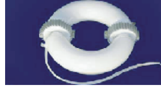
Circular Induction Lamp Inside