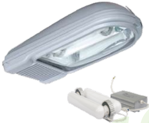
Fixture sizes (Unit: Inch/mm)