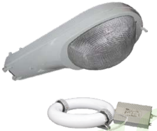
Fixture sizes (Unit: mm)