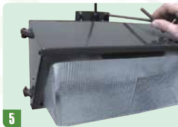
5 Mount the nut then lock them