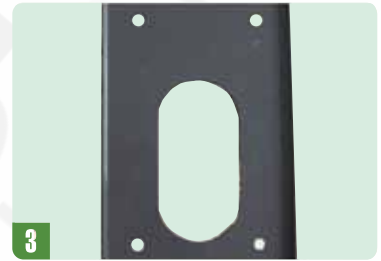
3 Drill 4 hole with \phi 8 . Assemble the expansion bolt on the wall and fasten the bracket on the wall with screw M6