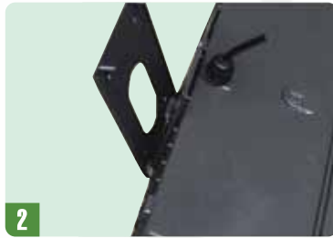
2 Take off the bracket