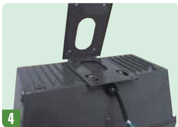
4 Put on the fixture